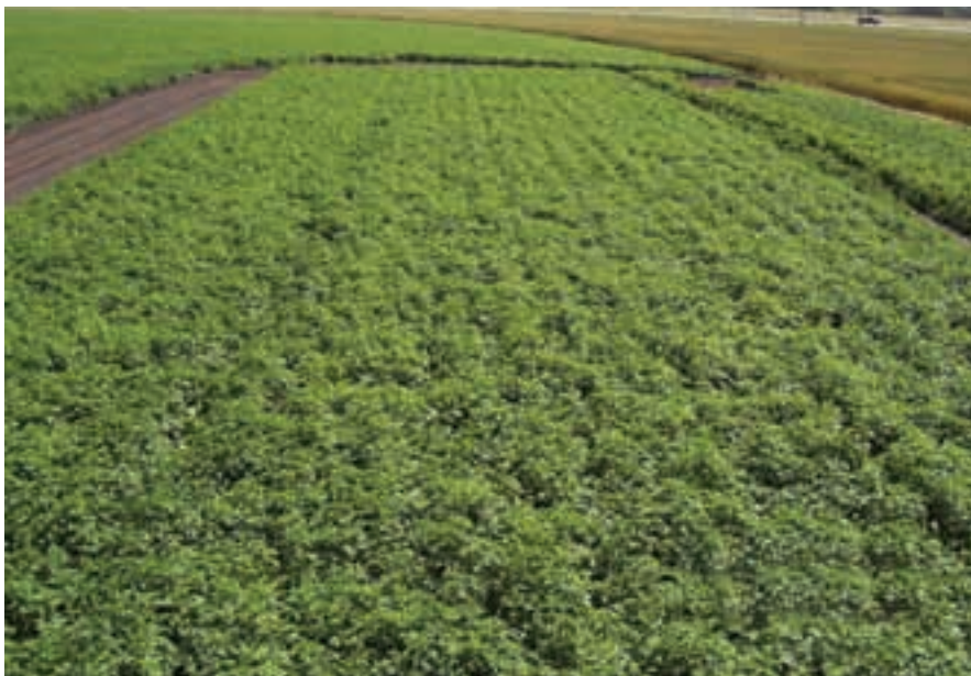
Southern Manitoba P and potato research site, August 2005.

In the current study, P application typically increased petiole P concentration at a given sampling date; however, petiole P criteria developed in potato-growing regions outside of Manitoba did not appear to consistently identify when positive yield responses to P application would occur. At all sites, increasing P rate also resulted in a linear increase in post-harvest soil test P levels in the surface zero to six inches. ■