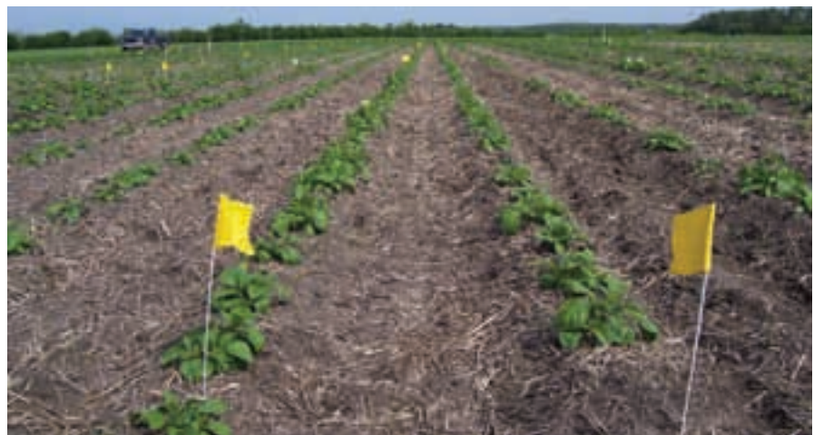
Timing of plant counts, mid-June 2005.

Petiole P concentration generally declined over the course of the growing season (Figure 1). In 2004 and 2005, increasing P rate increased petiole P concentration for each sampling date. In 2006, increasing P rate also increased petiole P concentration in the early part of the growing season, but this effect was not evident for later sampling dates. In 2003, P fertilization similarly increased or tended to increase petiole P concentration at most sampling dates, but effects were not as pronounced as in 2004 and 2005. In an extension bulletin from the University of Idaho, petiole P concentrations of less than 0.17 percent were considered low, 0.17 to 0.22 percent marginal, and greater than 0.22 percent sufficient for the fourth petiole